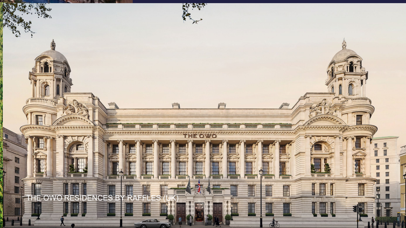
THE OWO RESIDENCES BY RAFFLES (UK)