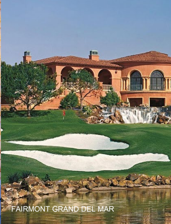
FAIRMONT GRAND DEL MAR