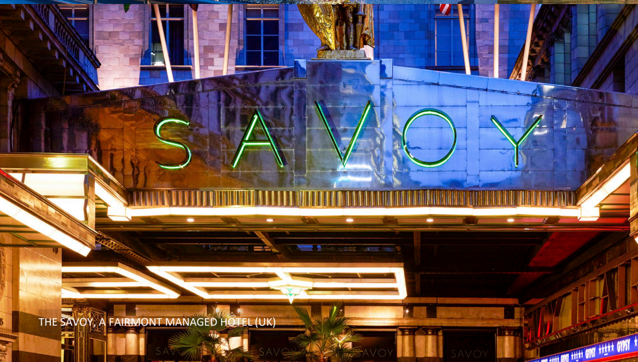
THE SAVOY, A FAIRMONT MANAGED HOTEL (UK)