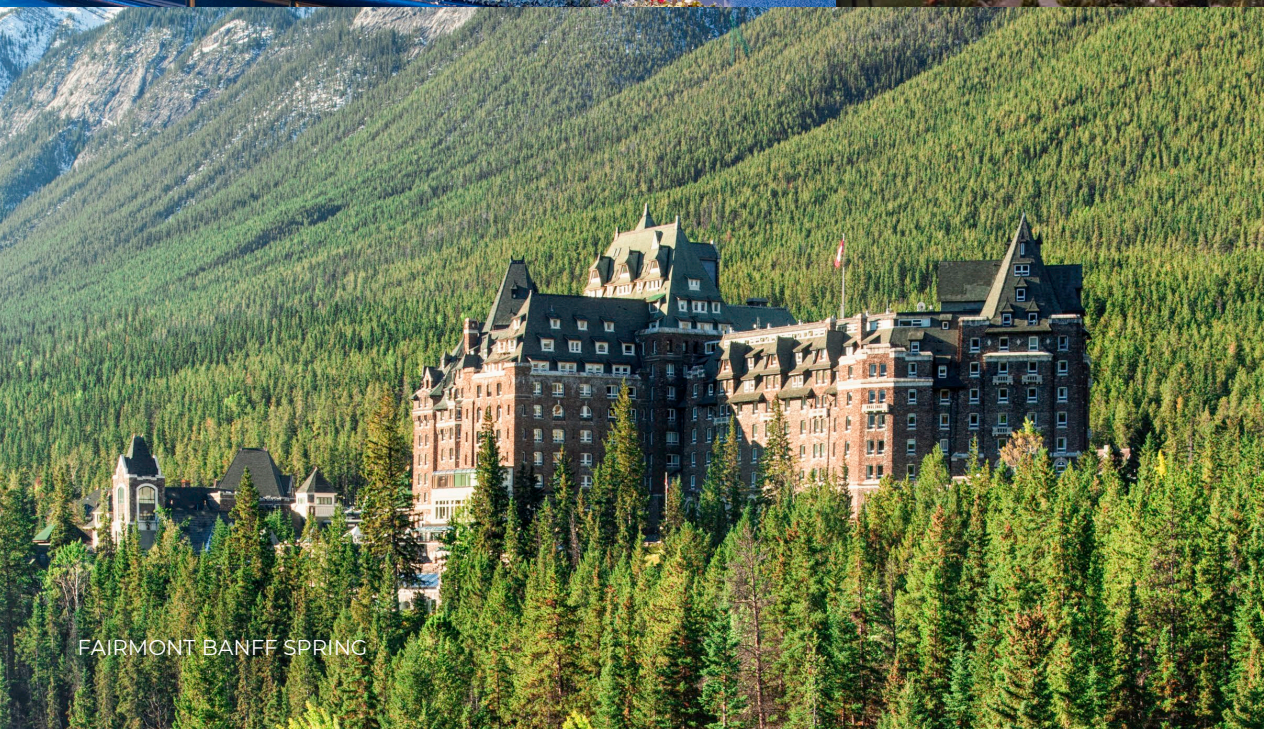
FAIRMONT BANFF SPRING

Fairmont, Raffles and Swissôtel Globally, Sofitel (North America)