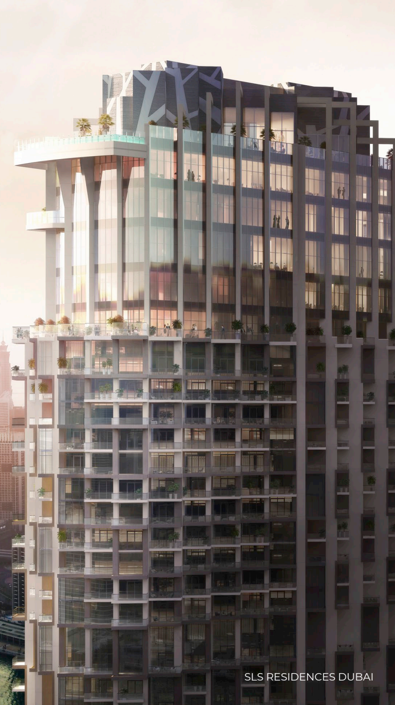
SLS RESIDENCES DUBAI