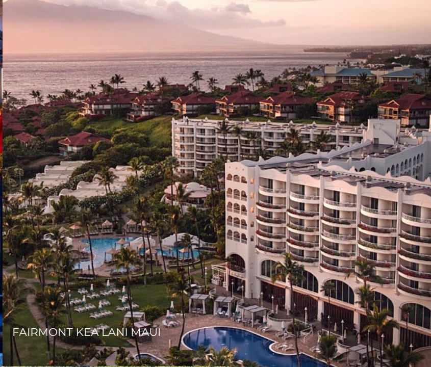
FAIRMONT KEA LANI MAUI