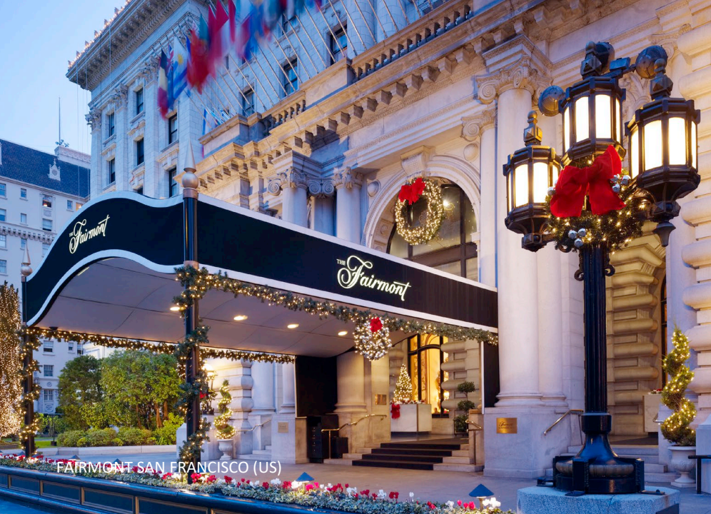
FAIRMONT SAN FRANCISCO (US)