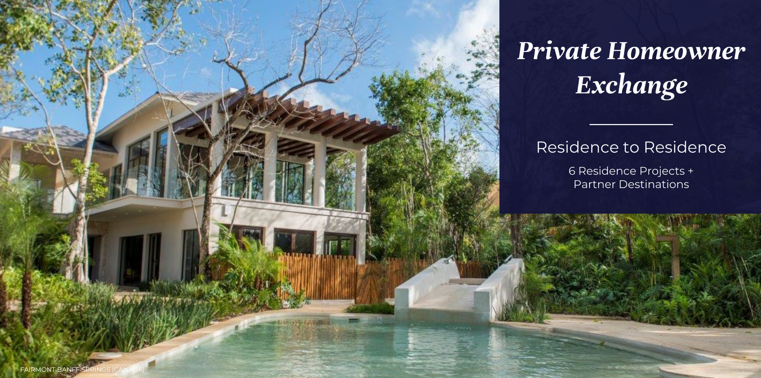
FAIRMONT BANFF SPRINGS (CANADA)