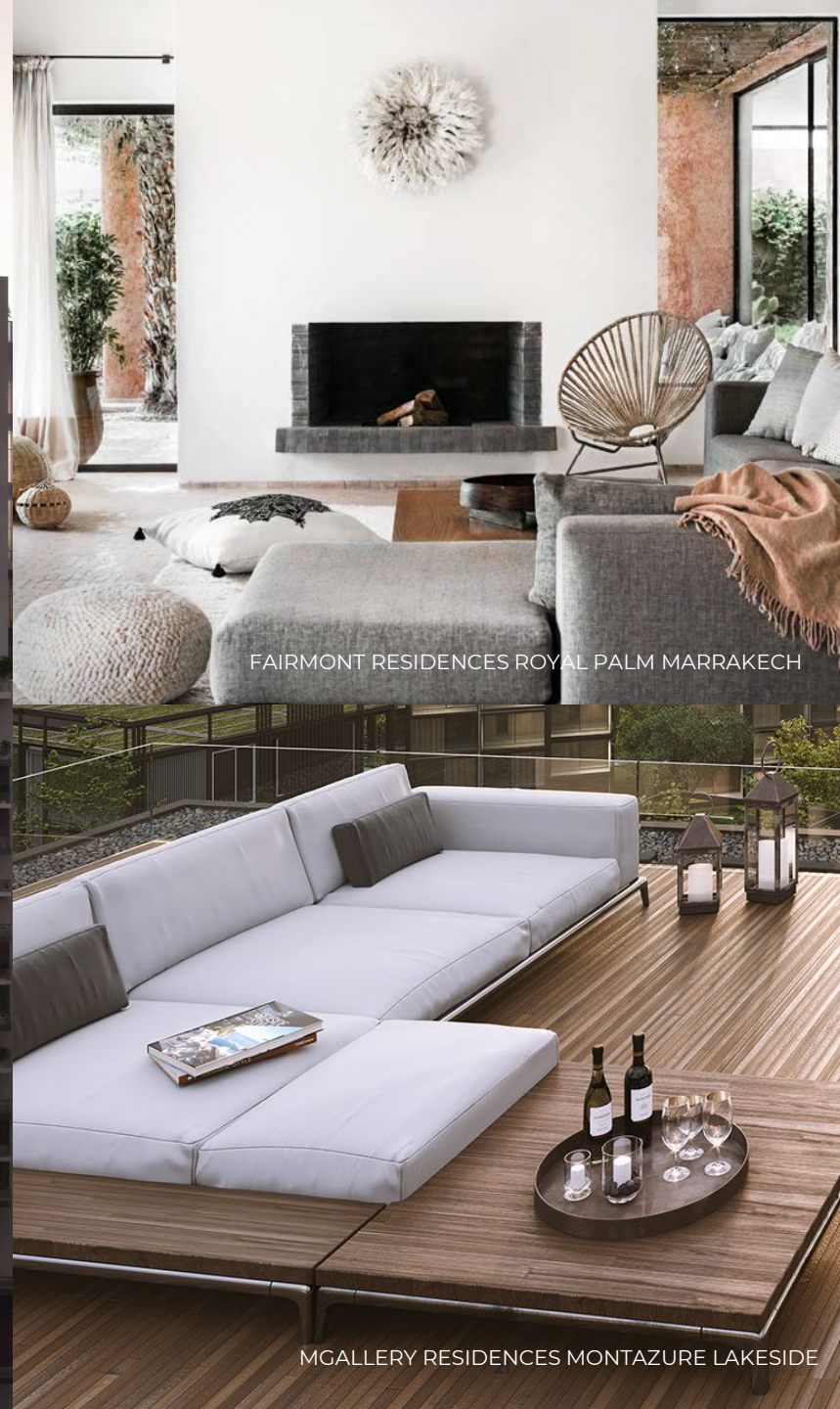
FAIRMONT RESIDENCES ROYAL PALM MARRAKECH