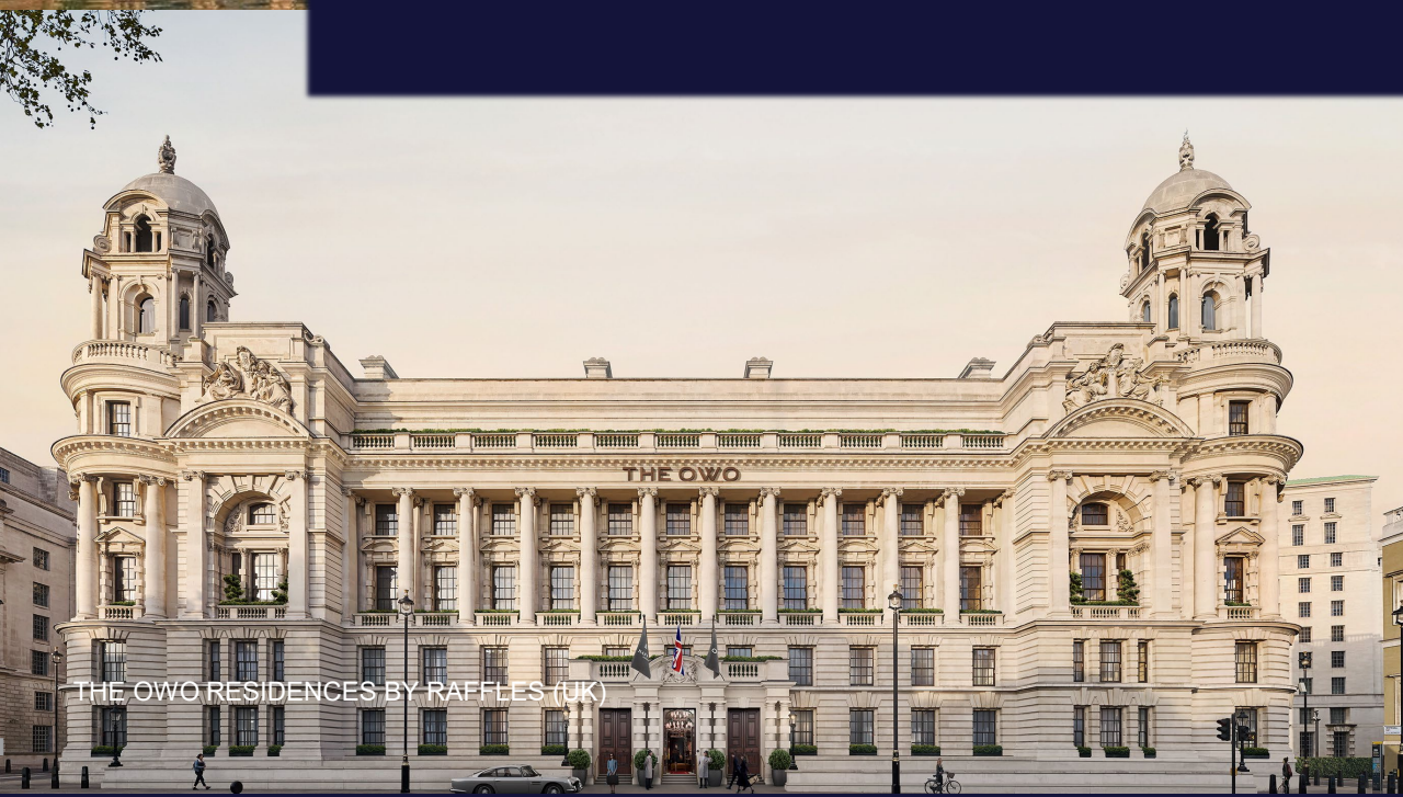
THE OWO RESIDENCES BY RAFFLES (UK)