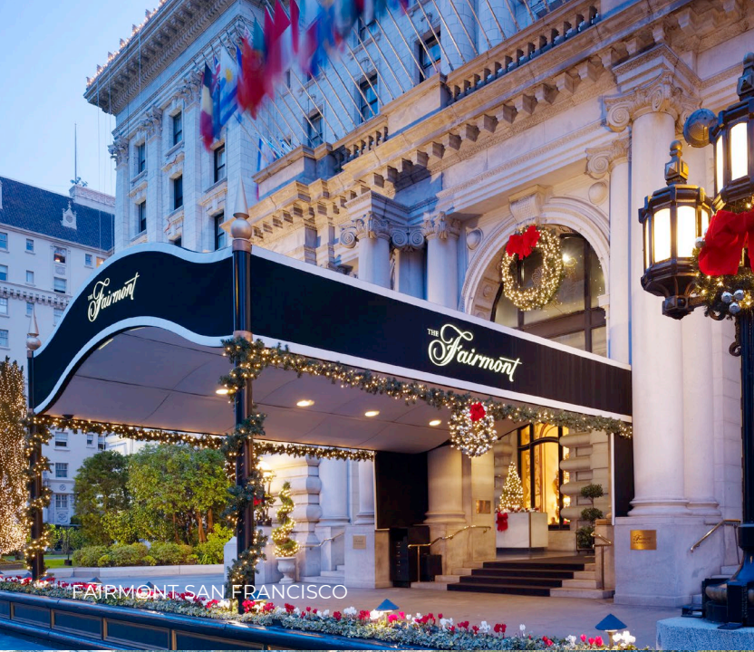
FAIRMONT SAN FRANCISCO